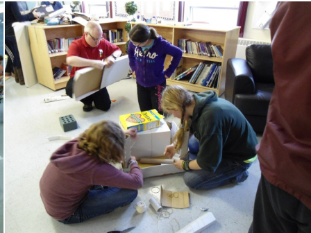
Middle Level students were challenged to design chairs.